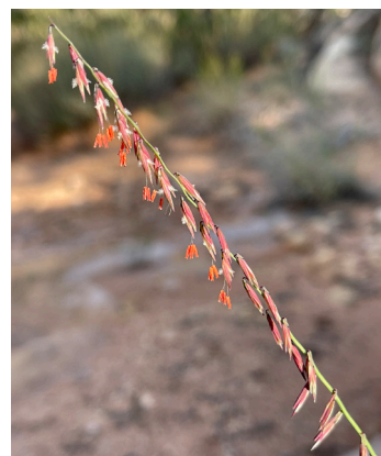
4 Side Oats Grama Bouteloua curtipendula Named after its seeds that dangle on one side of the flowering stalk. In bloom time its orange-red anthers, produce pollen.