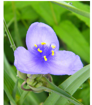
16 Ohio Spiderwort Tradescantia ohiensis Flowers only bloom for one day, opening in the morning and closing in the afternoon.