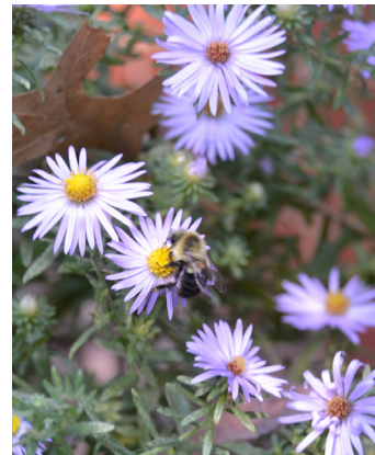
15 Aromatic Aster Symphotrichum oblongifolium Like goldenrods, asters provide pollinator forage at the end of the growing season.