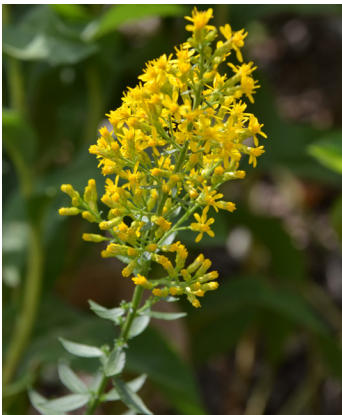
13 Showy Goldenrod Solidago speciosa The entire goldenrod ( Solidago ) genus is an important food source for insects and birds, especially its protein rich pollen in late fall.