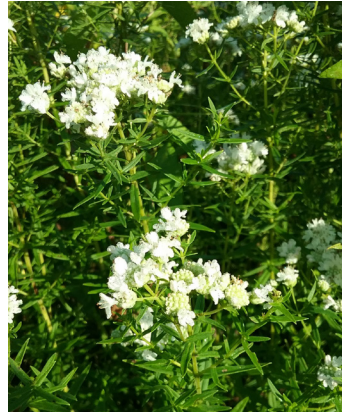
11 Virginia Mountain Mint Pycnanthemum virginianum Flowers are full of nectar and attract many pollinators, including beetles, wasps, and medium to large bees.