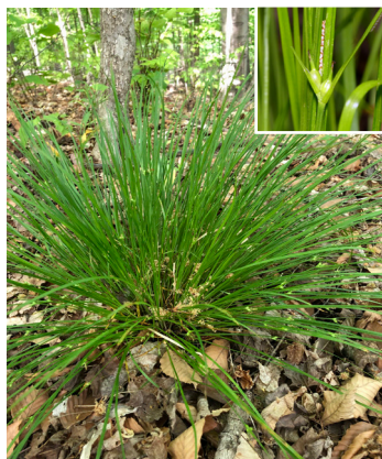
5 James' sedge Carex jamesii Its foliage and seeds are food for caterpillars and birds.