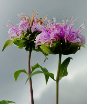
9 Wild Bergamot Monarda fistulosa These flowers open throughout the day, making them excellent forage plants for bumblebees.