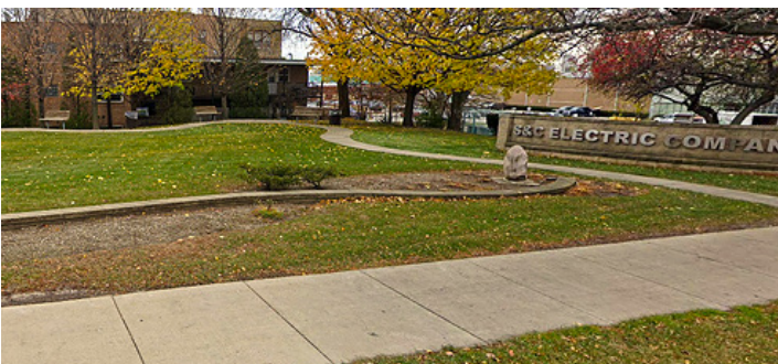
Before plants were installed in Arlys Conrad Memorial Park and Native Pollinator Garden, S&C Electric Company, Chicago, Illinois.