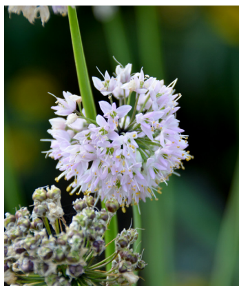
1 Nodding Onion Allium cernuum Flowers provide nectar and pollen to beetles, bees, and flies. Cellophane bees are frequent visitors.

In 1909, S&C Electric Company transformed the delivery of safe, reliable electricity with the invention of the Liquid Power Fuse. Today, as the world faces extreme weather events and the demand for electricity grows, S&C continues to innovate and modernize the electrical grid, ensuring reliable and resilient power for homes, communities, and critical infrastructure around the world.