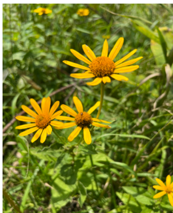
7 False Sunflower Heliopsis helianthoides Soldier beetles and bee flies are common visitors of this flower. Female leafcutter bees cut leaf pieces to line their nests.