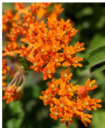
3 Butterfly Milkweed Asclepias tuberosa Milkweeds host monarch butterfly caterpillars. Monarchs only lay eggs on milkweeds and cannot reproduce without them.