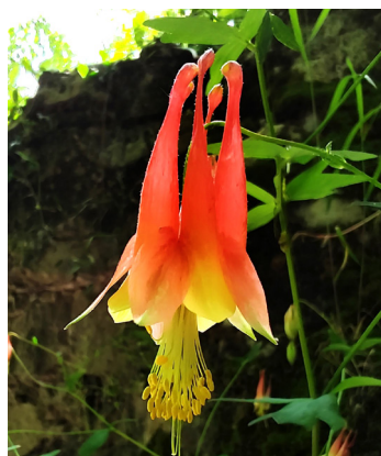
2 Wild Columbine Aquilegia canadensis Bloom time coincides with the arrival of the ruby-throated hummingbird and is an important source of nectar for them.