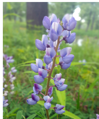
8 Wild Lupine Lupinus perennis This plant lacks nectar but provides pollen to many bees and hosts several butterfly species.