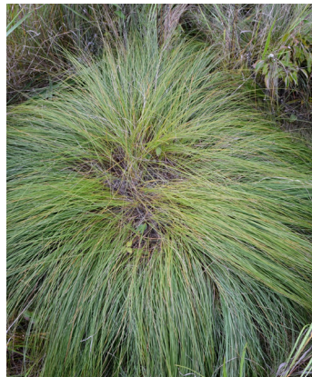
14 Prairie Dropseed Sporobolus heterolepis Butterfly and moth caterpillars eat the foliage of prairie dropseed, and small birds feed on its seeds.