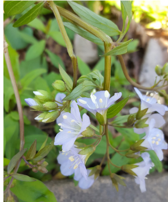
10 Jacob's Ladder Polemonium reptans Large bees are the most effective pollinator of this spring blooming plant.